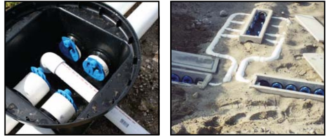
Custom Distribution Boxes with Equalizers installed

PATENTS: U.S.A. - 5,680,989 - 5,154,353 - 5,107,892